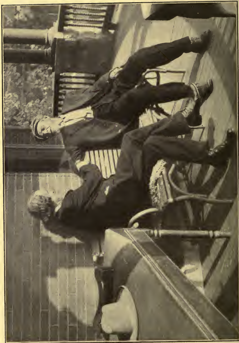
"THE OLD DOCTOR" AND ELBERT HUBBARD On the veranda at Kirksville